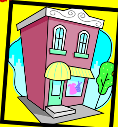
Looking Glass Boutique