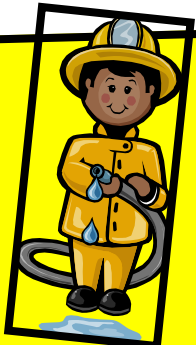
Portland Police & Fire Department