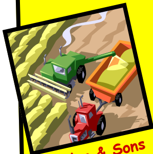
Bader & Sons