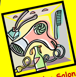
About You Salon